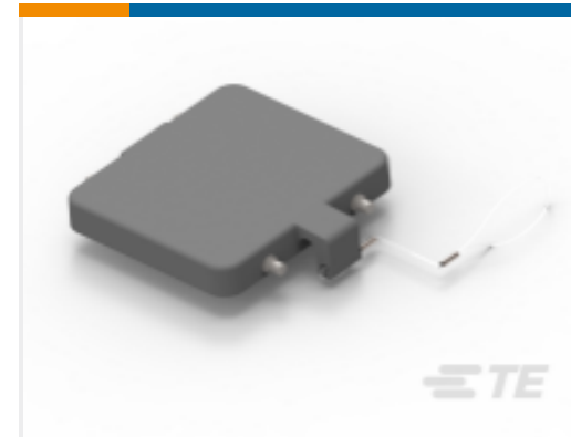
TE Part # T1000321320-000 H32B-KDBP-BOM