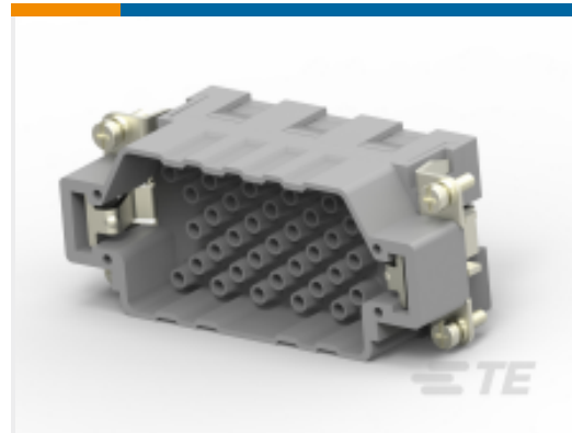
TE Part # T2050802101-007 HEEE-040-M 41-80