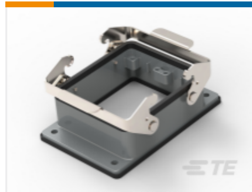
TE Part # T1410322000-000 H32B-AG