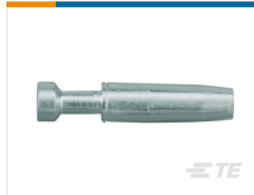
TE Part # T2030002040-000 CEF-4.0